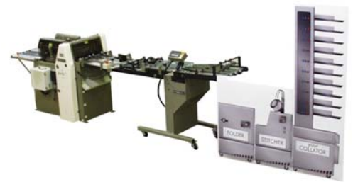
318 SA Trimmer & 252 Conveyor with any Tower Collating Unit In-Line Trim Solution