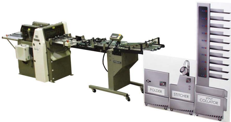
In-Line solutions shown with Rosback 3-Knife Trimmer.