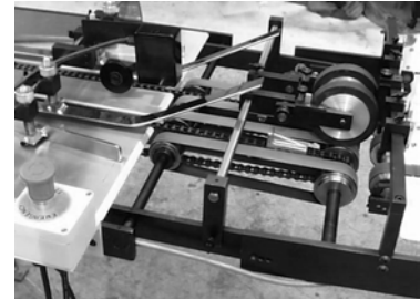
Conveyor unit connects to Rosback 3-Knife Trimmers.