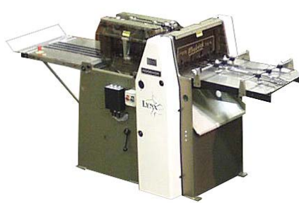
318 Series Trimmers with Tape Track