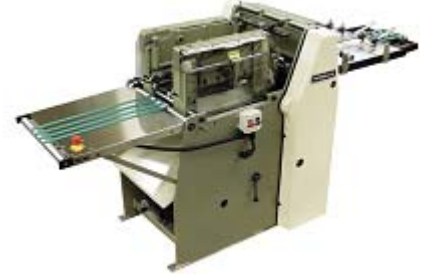
250RC Trimmer with Roller Track