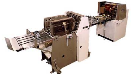
250CB Trimmer & 953 Feeder Off-Line Trim Solution